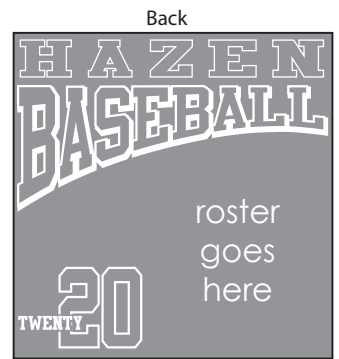
All items are grey with green, black white print